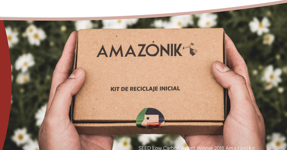
SEED Low Carbon Award Winner 2018 Amazónico

Amazónico offers a collaborative recycling WebApp that incentivizes users to recycle through a door-to-door collection service and rewards scheme. The enterprise helps to formalize recyclables collection in association with waste worker groups and provides sustainable employment within the waste management sector.